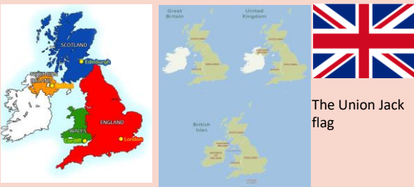
The Union Jack flag